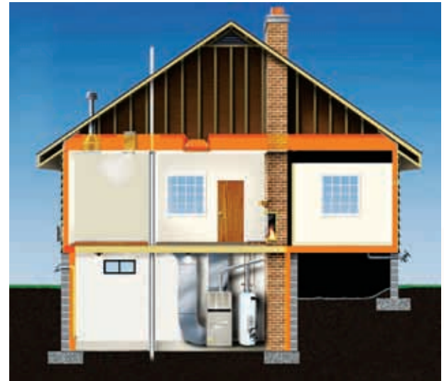
Where proper insulation works to keep homes warm in winter and cool in summer.